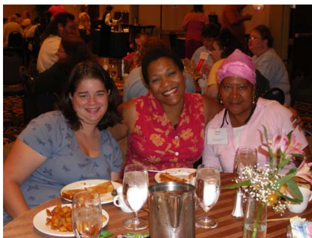
Magnolia Clubhouse was honored by OAMH to be named the "Peer Support Program of the Year" in 2003.

We made a presentation to describe the Clubhouse Model and Magnolia Clubhouse, to a workshop of about 30 people. We gave personal accounts of our many clubhouse experiences, including our social and work opportunities, and described our special focus on giving encouragement to young adults in the Clubhouse. We all worked as a team. We talked about the impact that the clubhouse has on our