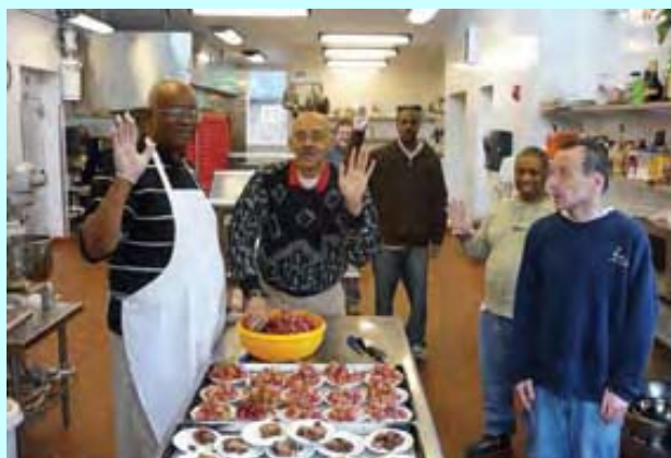
Magnolia Clubhouse members and staff prepare nutritious meals each day in their new, expanded kitchen facilities.